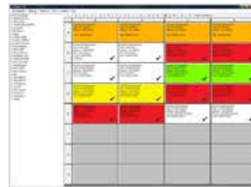
User-friendly Soleris software is LIMS configurable and 21 CFR compliant.