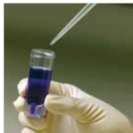
Inoculate ready-to-use vial.