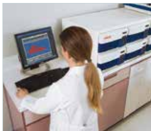
Record sample identification into the computer.