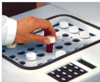
Place the vial into the Soleris incubator.